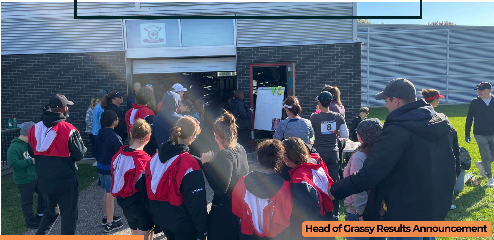
Head of Grassy Results Announcement