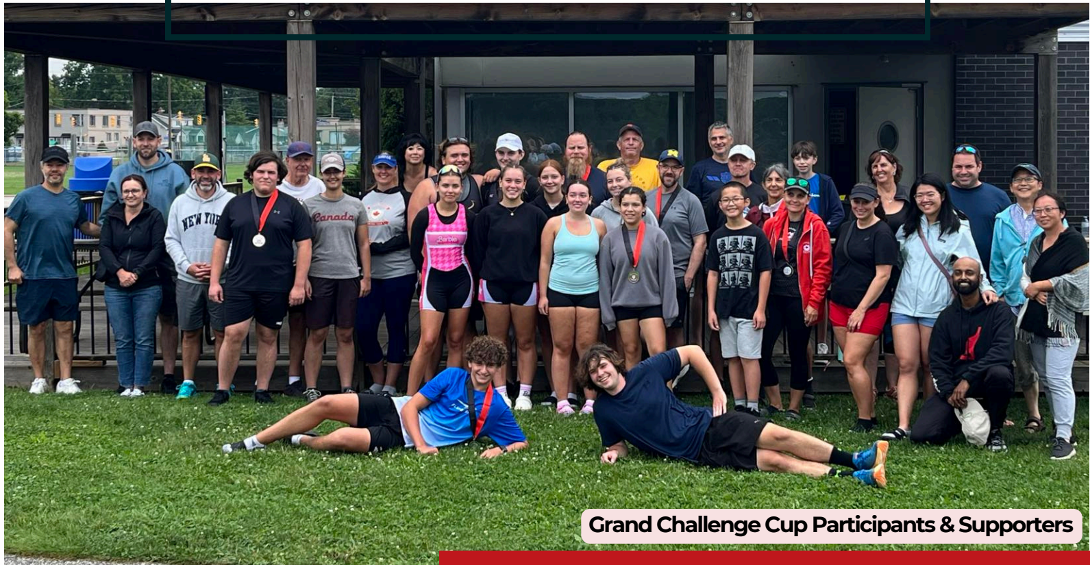
Grand Challenge Cup Participants & Supporters